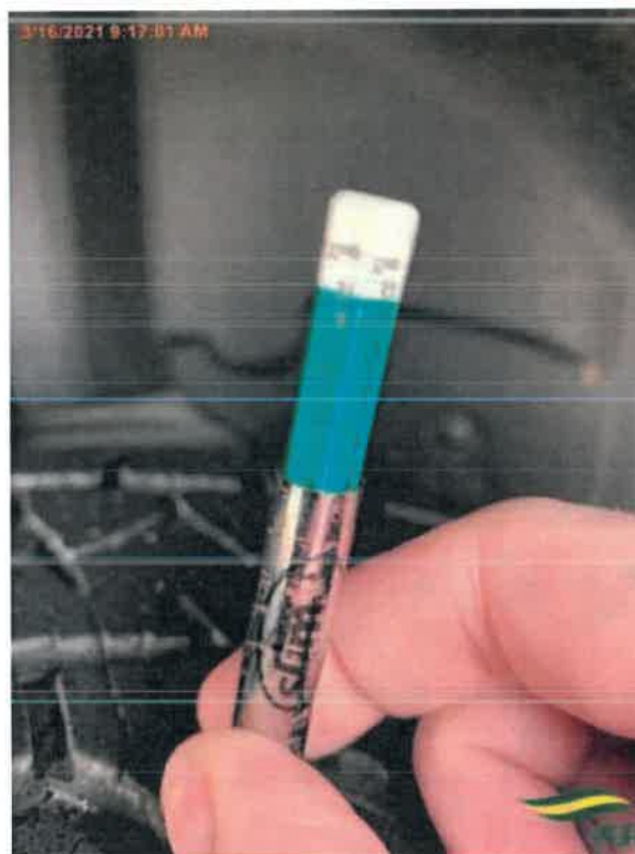
Document Name: RR Tire Gauge.jpg