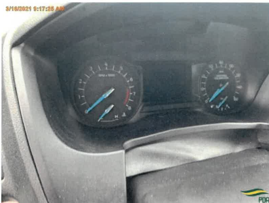
Document Name: ODOMETER.jpg Remarks: ODO - LAST RECORDED 42000