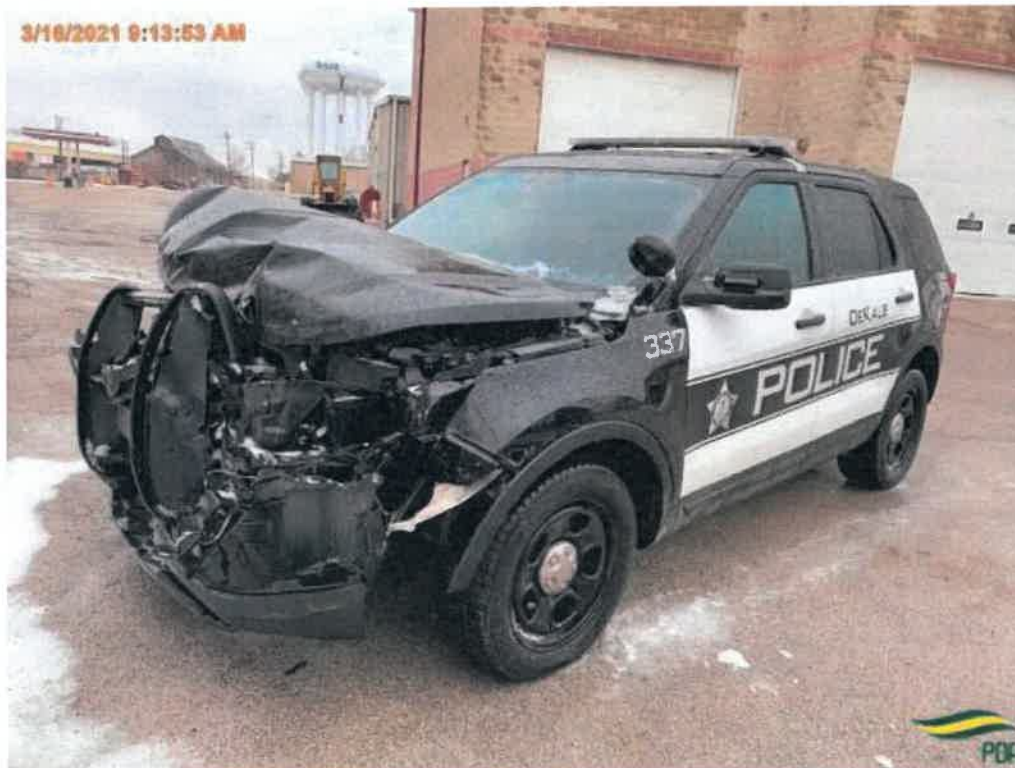
Document Name: LEFTFRONT.jpg