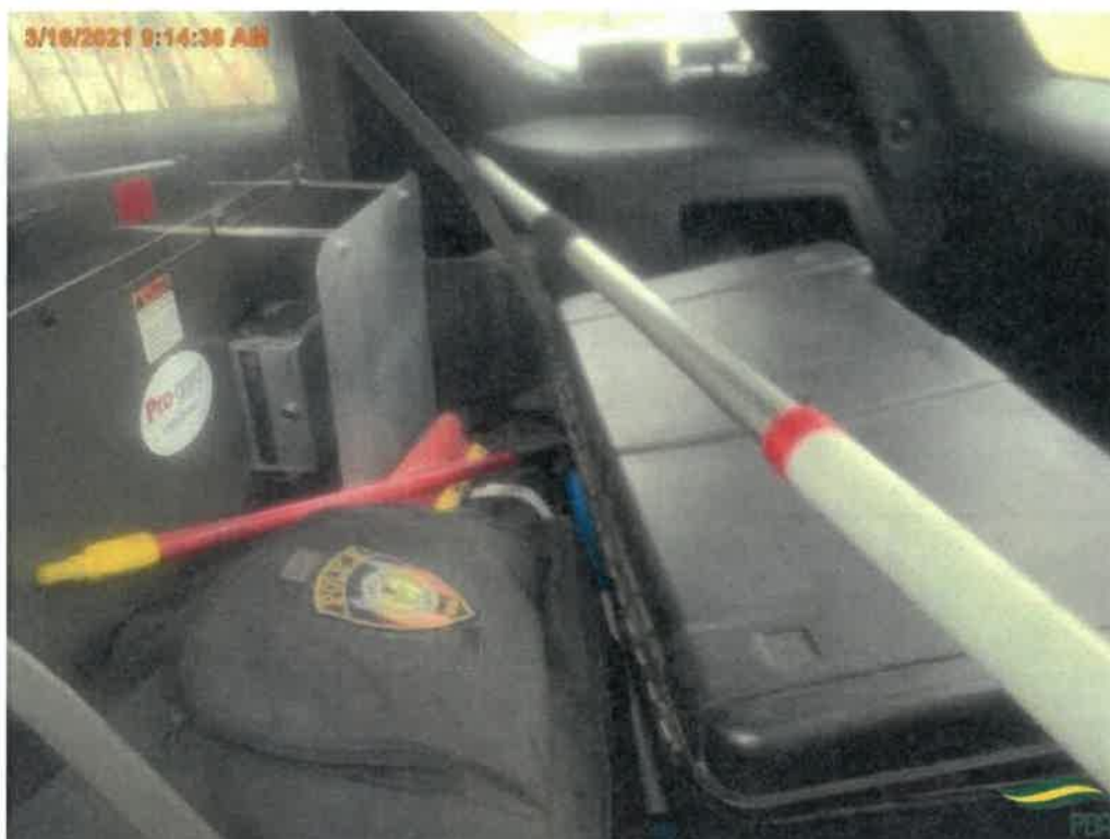
Document Name: Trunk.jpg