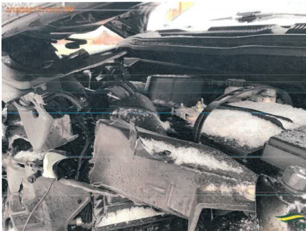
Document Name: Hood.jpg