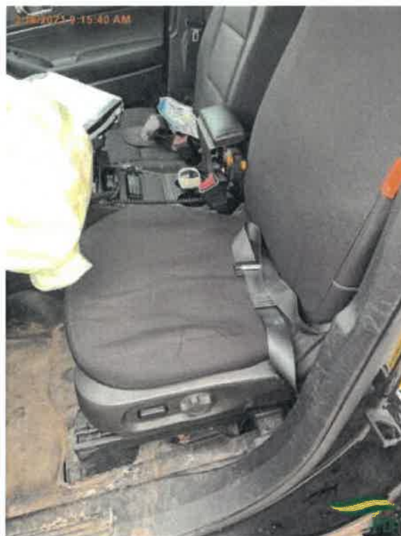
Document Name: Seat.jpg