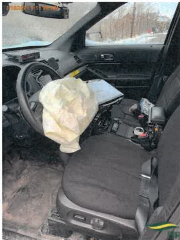
Document Name: INTERIOR.jpg