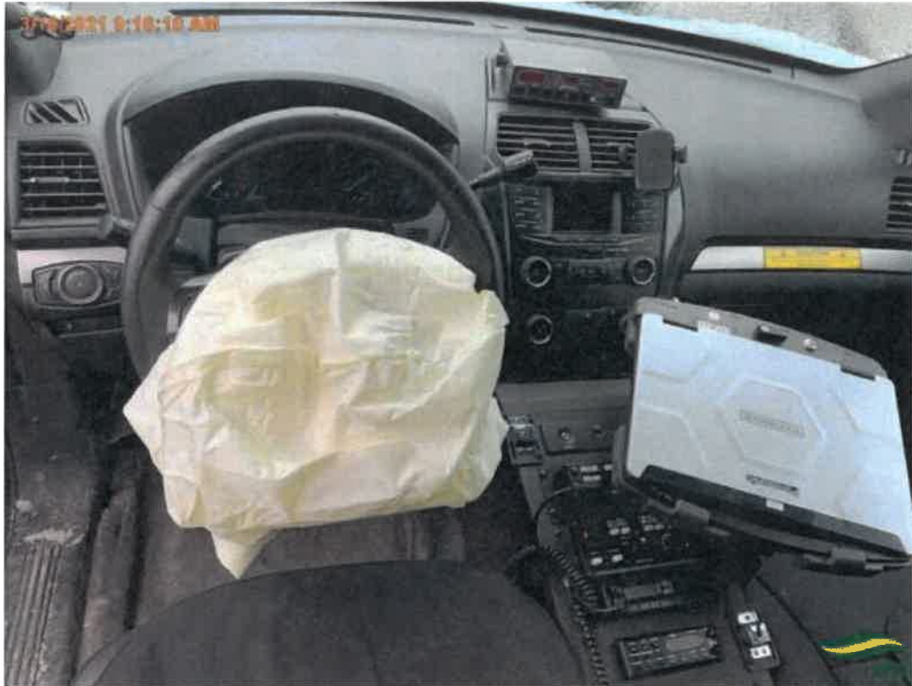
Document Name: INSTRUMENTPANEL.jpg