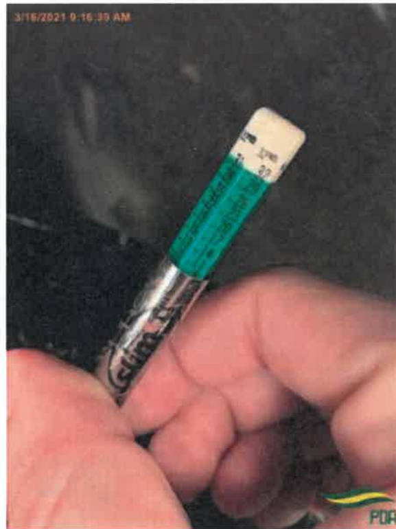
Document Name: LF Tire Gauge.jpg