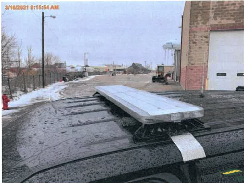
Document Name: Roof.jpg