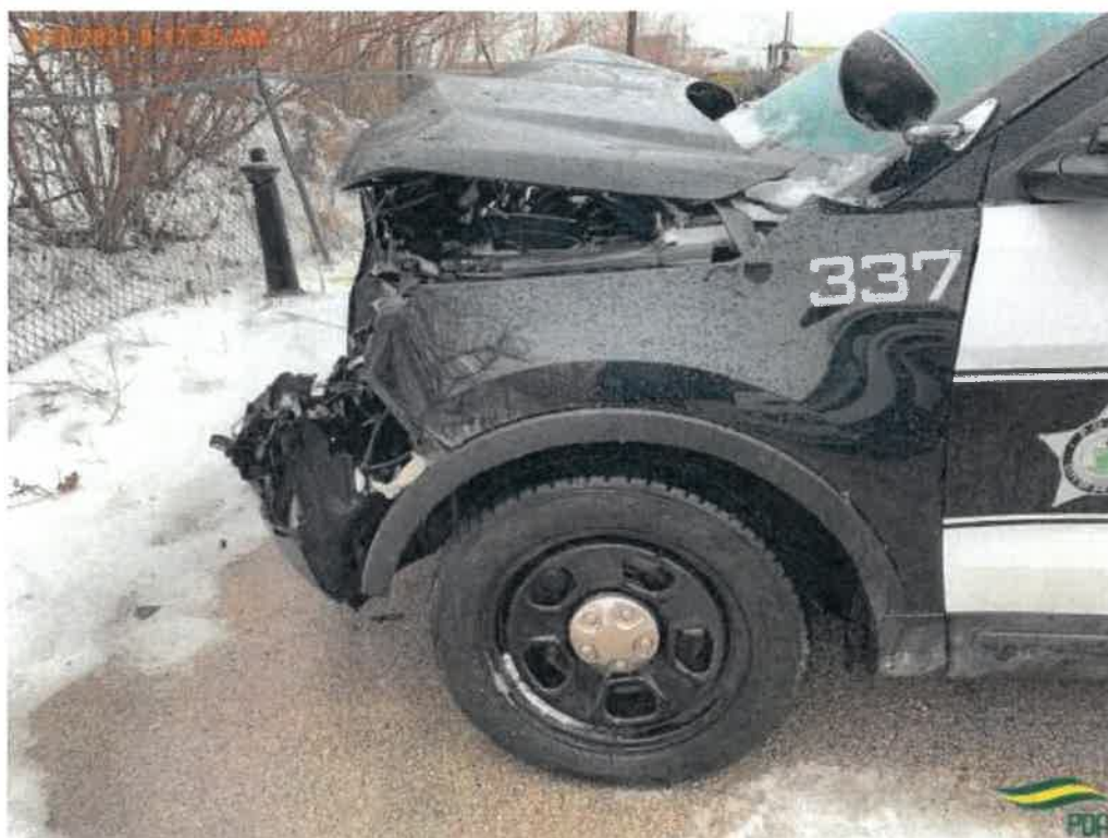
Document Name: OVERALL LF SIDE.jpg Remarks: