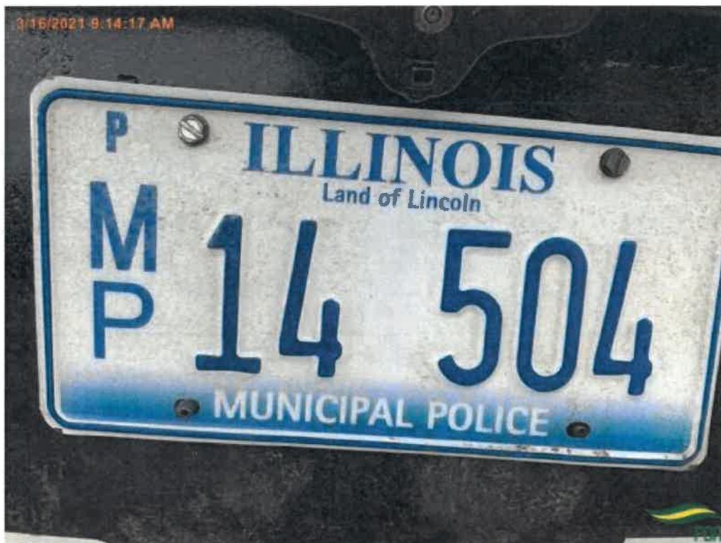
Document Name: LICENSE.jpg