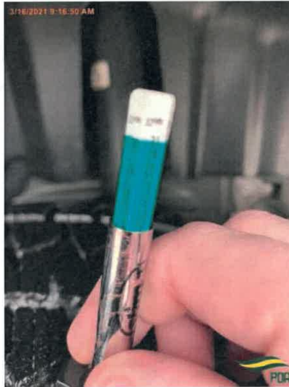
Document Name: LR Tire Gauge.jpg