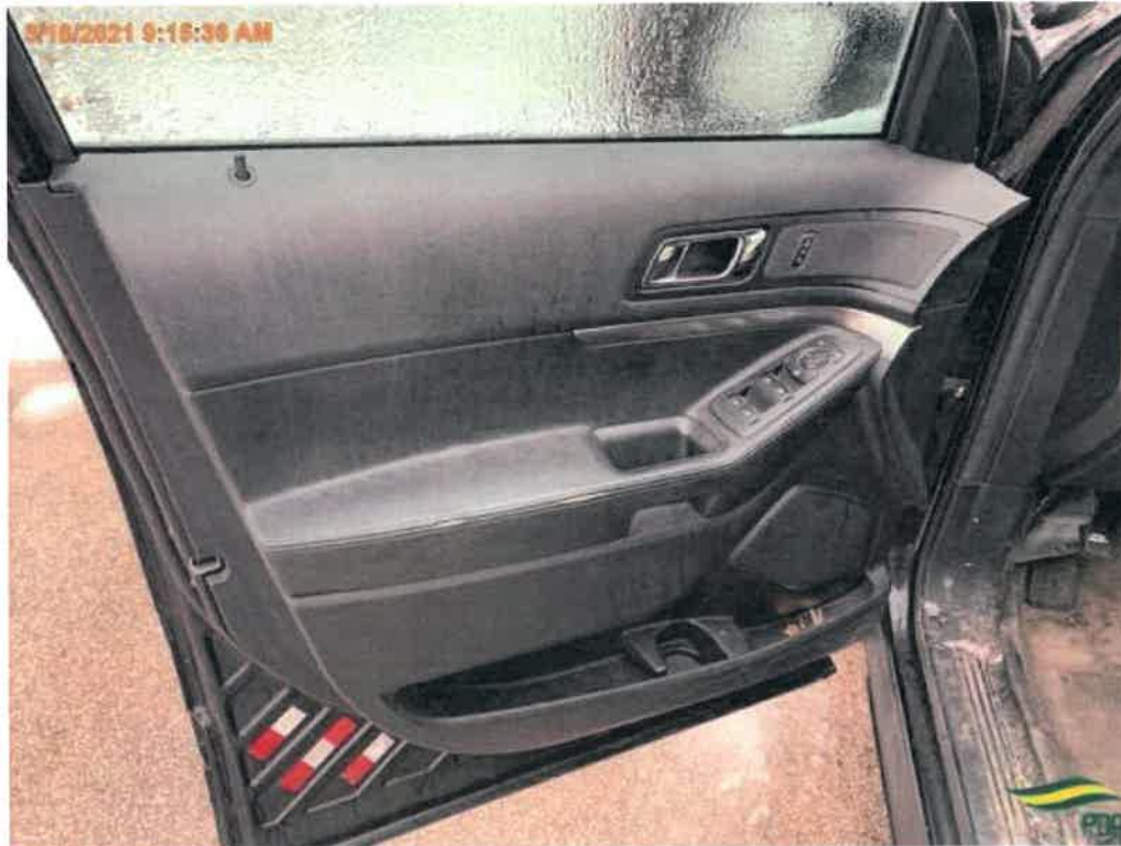
Document Name: Door.jpg