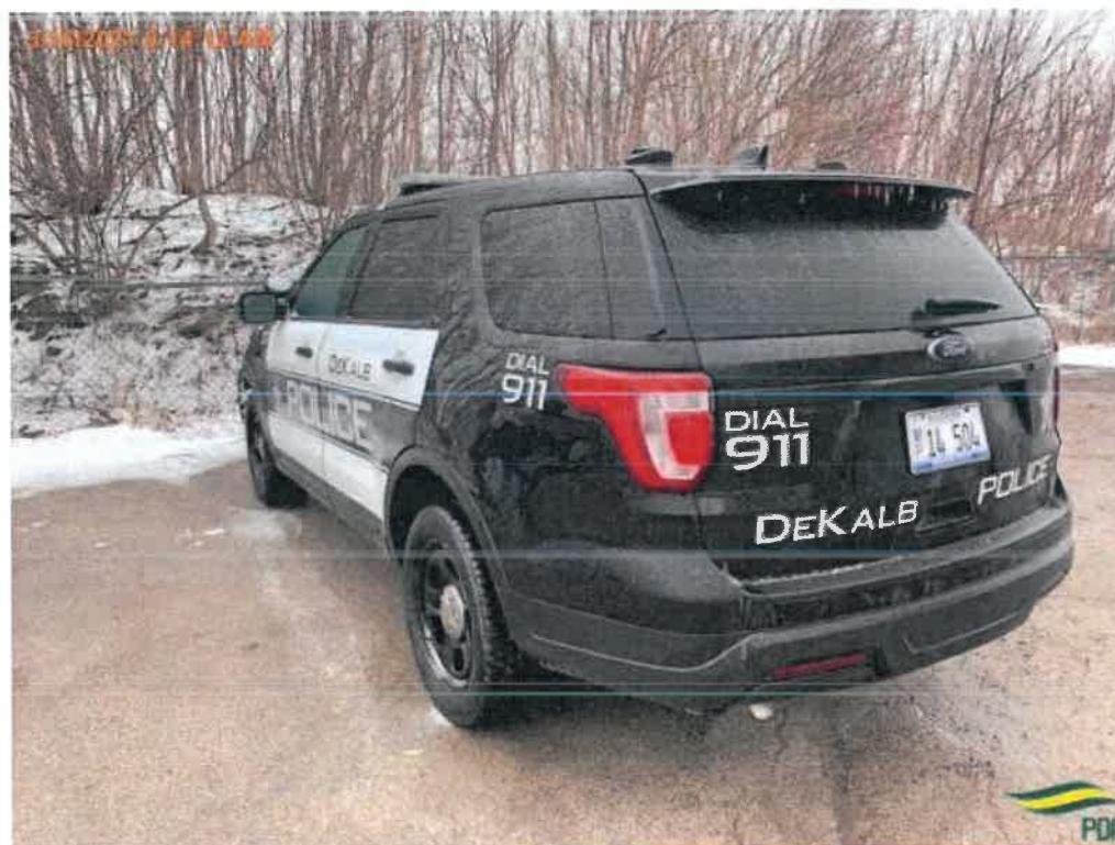
Document Name: LEFTREAR.jpg