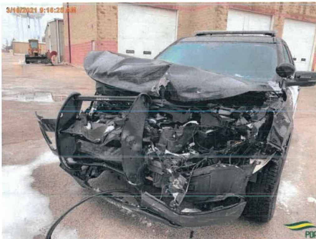
Document Name: NEWDAMAGE.jpg